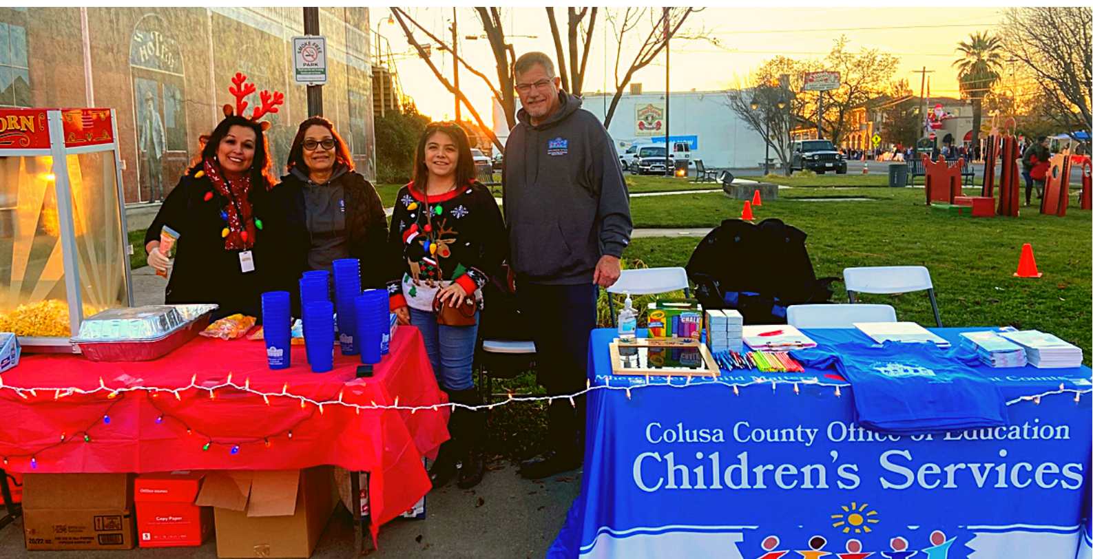
CCOE Children's Services employees providing outreach at the Williams Festival of Lights 2022

Communicate ● Collaborate ● Operate ● Educate